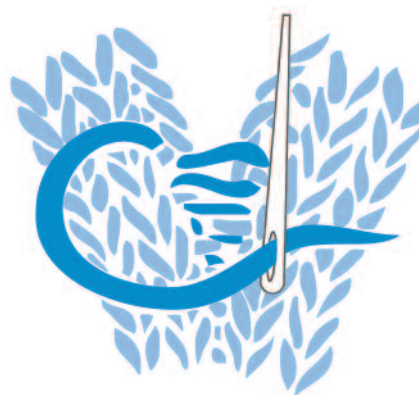
Stitching an invisible seam.